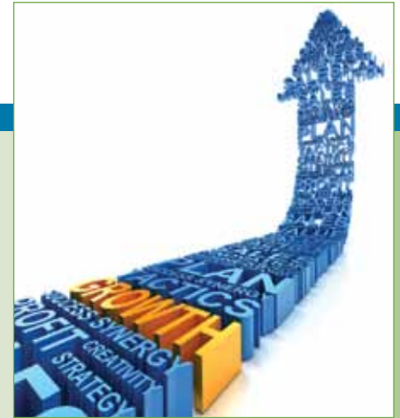
Boost Channel Integration, Targeting, Sales & ROI

Traditional CRM solutions can cost hundreds of thousands of dollars and require complicated changes to the enterprise systems that drive your business.